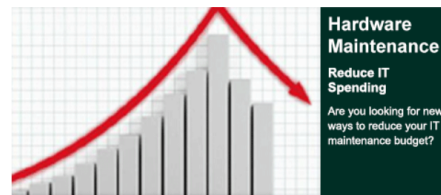
WORLDWIDE MULTI-VENDOR SUPPORT